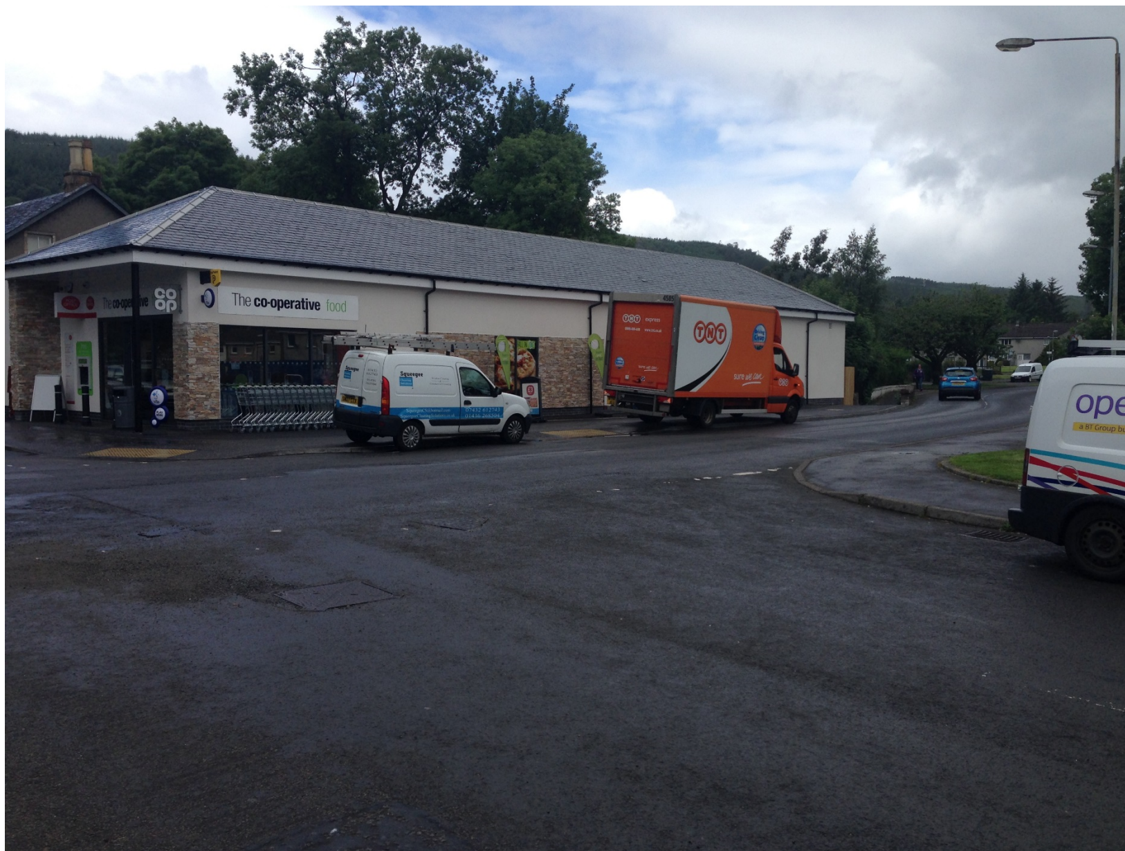
Appendix B – Photo of proposed location for the pedestrian crossing, also showing vehicles parked on the pavement outside the Co-op.